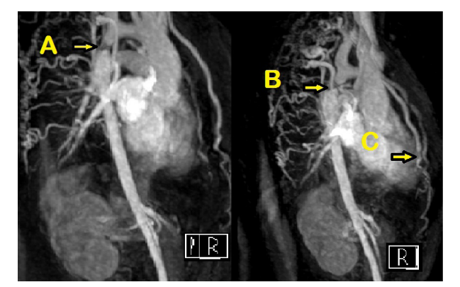
Figure 2. A-B: Magnetic resonance angiography demonstaring severe coarctation of the aorta distal to the left subclavian artery and also marked enlarged collateral arteries; C: magnetic resonance angiography also showing significant left circumflex lesion

Coronary angiography was failed via the femoral approach because of severe CoA (Figure 1B). Therefore left radial artery was prefered. Coronary angiography revealed significant stenosis in the distal part of left circumflex artery (Figure 1A). Magnetic resonance angiography supported the diagnosis of severe CoA localized distal to the left subclavian artery (Figure 2A and 2B). Transthoracic echocardiographic examination was performed. Echocardiography showed left ventricular